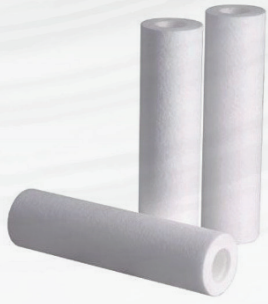
IQ Life Water 1st Stage Filter Cartridge (UF Membrane Backwash Filter)