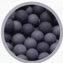
IQ Life Water 第二层滤芯 磁铁矿陶瓷球